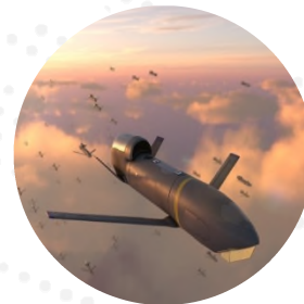
Advanced / Special Programs