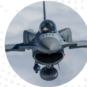
Sensors and Global Sustainment