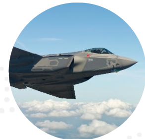
Air Dominance and Strike Weapons