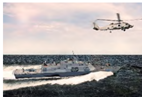
Integrated Platform Solutions

← Cross Business Capability Integration →