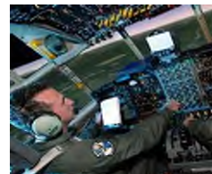
Training / Aviation Solutions